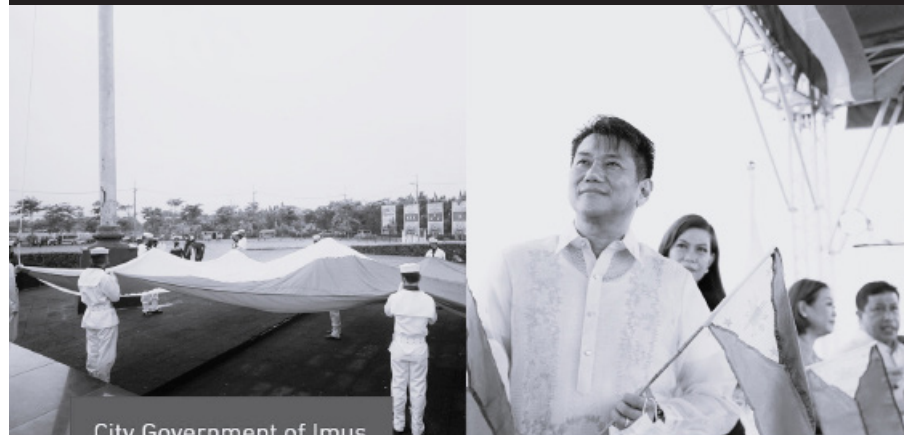
City Government of Imus